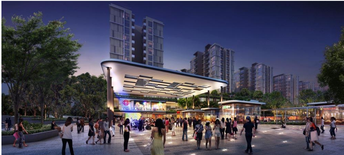
Northpoint City set to be key gathering spot for community, with large areas set aside for community activities.

The Nee Soon Central Community Club will move into the South Wing of the mall by 2018 and will be the first Community Club in Singapore to be housed in a shopping mall. The Yishun Public Library will also be re-opening in the mall by the first quarter of next year.