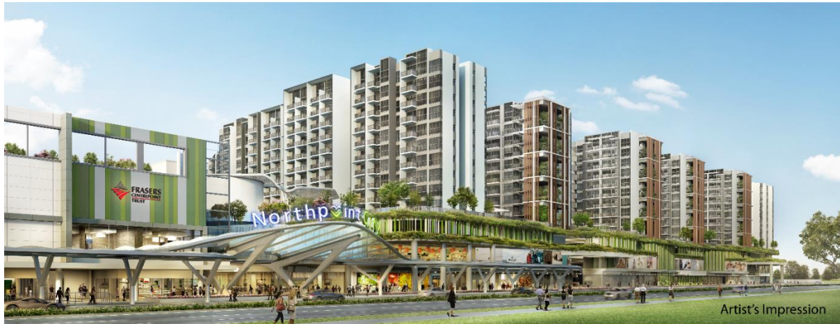
Artist's impression of Northpoint City

SINGAPORE, JULY 25, 2017 – The largest mall in Northern Singapore will open to shoppers in the fourth quarter this year. Developed by Frasers Centrepoint Singapore, the mall is part of Northpoint City, the largest integrated development in the North, housing over 400 retail and dining outlets across two retail wings. When completed, the 1.33 million square feet Northpoint City will also include the 920-unit North Park Residences, community spaces, an air-conditioned bus interchange and an underground retail link with direct access to Yishun MRT Station.