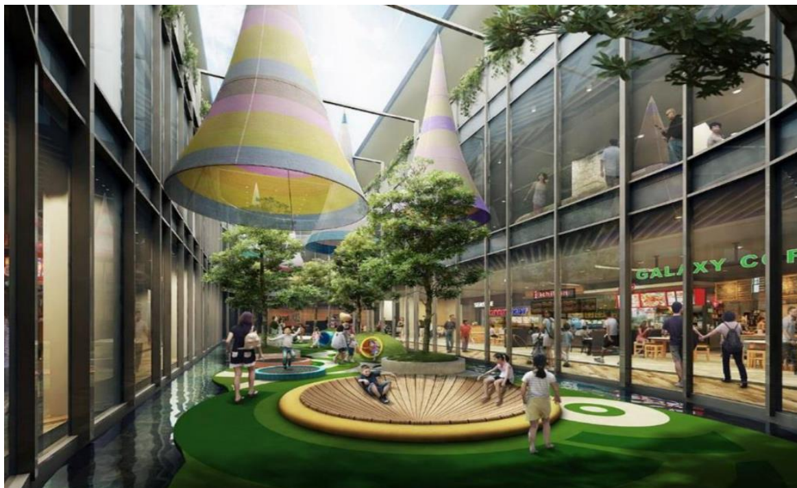
Artist's Impression of The Courtyard which connects the North and South Wings of Northpoint City.