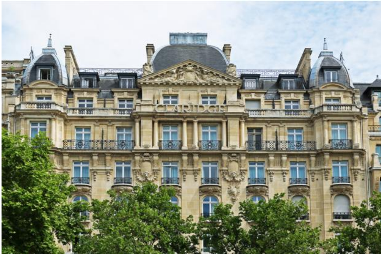
Fraser Suites Le Claridge Champs-Elysees

Inventory set to double to 30,000 residence units by the time Frasers Hospitality turns 21